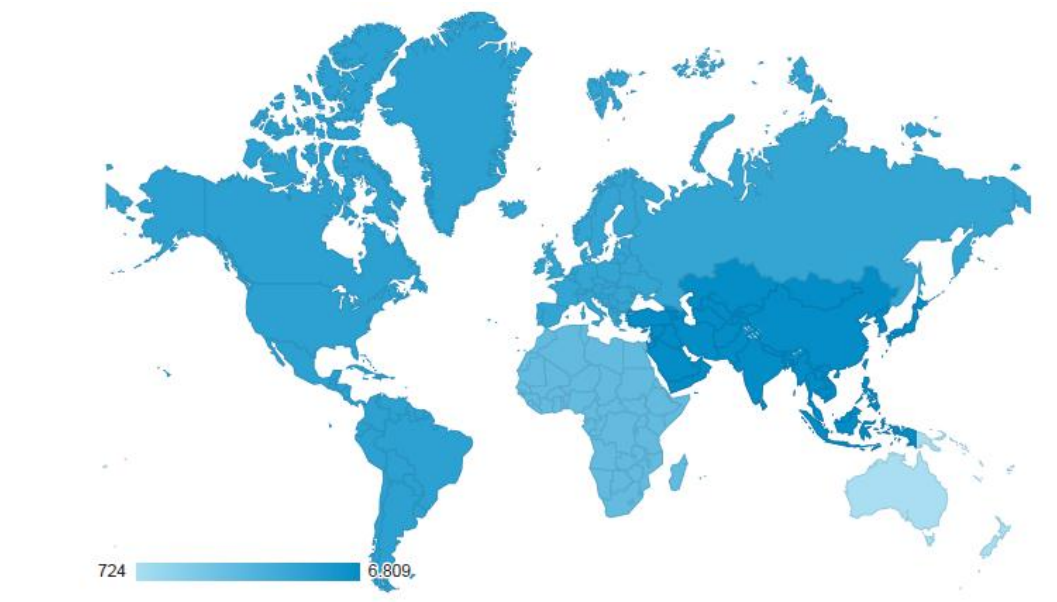
Figure 1. Website visits in 2014 on a world map

Figure 1 shows the distribution of the website visits across the world for 2014. The map shows that most visits are from Asia. A regional break-down of the website visits in numbers and percentages is shown in figure 2. This shows that over 50% of website visits is from the developing world.